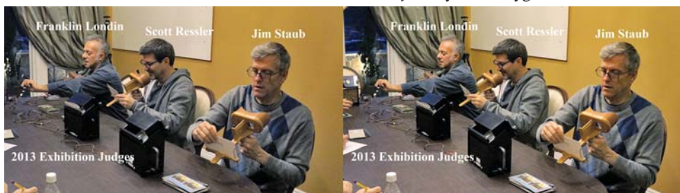
2013 Hollywood Exhibition Judges.