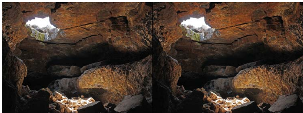
Digital Section Honorable Mention: “ Balcony Cave ” by Mat Bergman