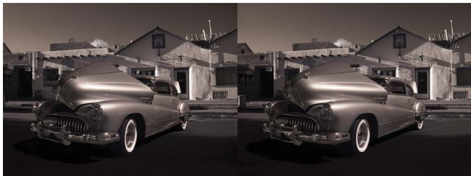
Digital Section Honorable Mention: “ Buick Route 66 ” by Chris Reynolds