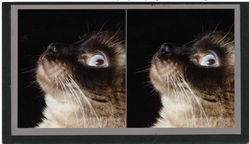
Card Section Honorable Mention: “ Blue Eyes ” by Linda Nygren 4*