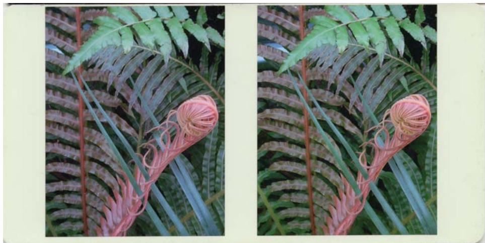
Card Section Bronze Medal: "Ferns" by Geoffrey W. Peters 5*