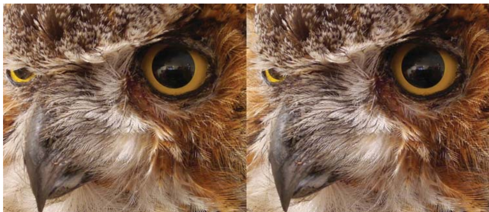
Digital Section Silver Medal: " Owl Close Up " by George A. Themelis 4*