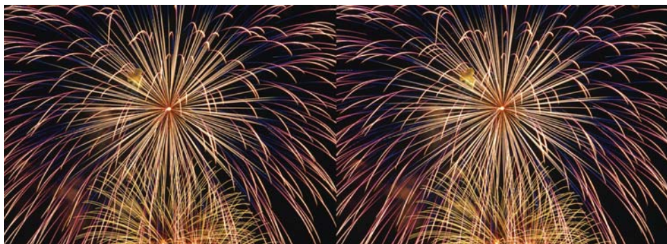
Digital Section Bronze Medal: " Majestic Burst " by Bob Venezia 5*